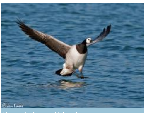
White-fronted Goose iffs (Mull of Oa). Last year we only had about 3 about a week, basing ourselves at Port Charlotte

Islay does not have the high hills of Jura but has unspoilt areas of moorland, peat bogs, woodlands, scrub, freshwater lochs and arable land. Coastal areas include extensive shingle