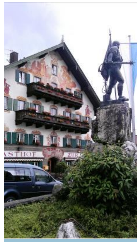
The Smith of Kochel