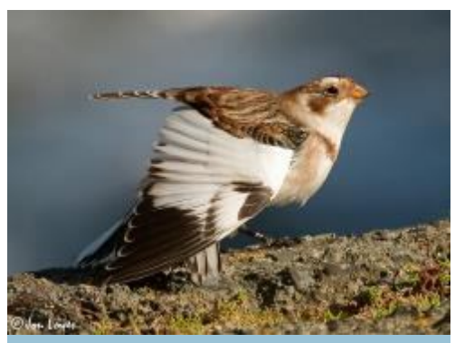
Snow Bunting

There was a big irruption of Waxwings this year and small numbers were spotted in the valley in both November and December. In December a Hawfinch was in the woods at the top of Sickleholme Golf Course.