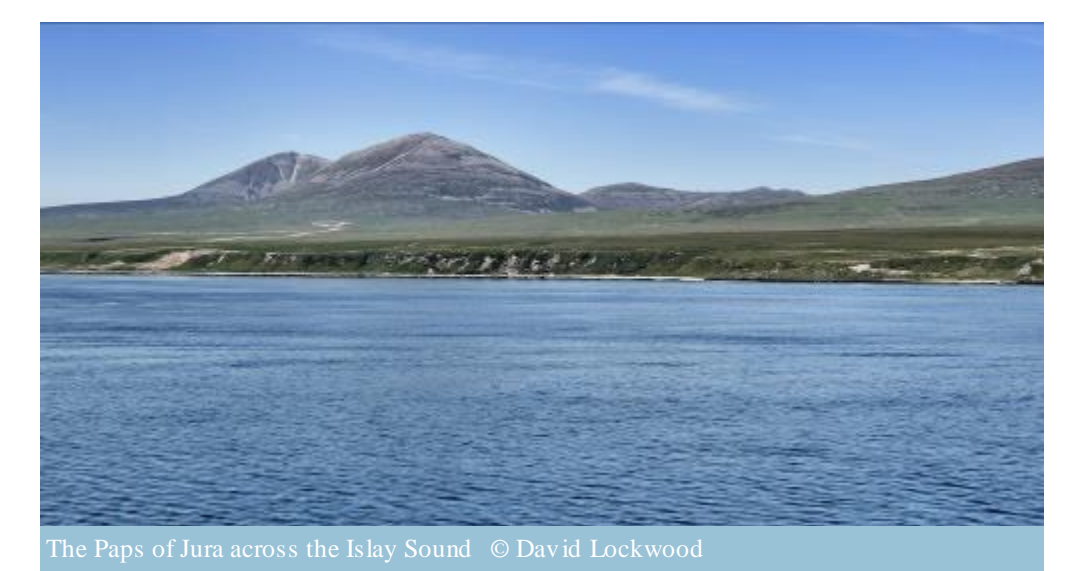
16 The Dipper

Jura : different again; a small open ferry battles the current across the Sound of Islay to Jura – it takes about 10 minutes then 8 miles of single track road to the little village of Craighouse. Jura landscape is harsh, unforgiving and rough, but (for me) has stunning scenery and wildlife. Craighouse is in an exquisite setting, being sheltered in the beautiful Three Isles Bay with the spectacular Paps and the rest of Jura behind. The west coast is completely uninhabited with no roads and extremely difficult access, except for the Grey Seals.