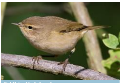
Chiffchaff

Sing on sing on; then in my cage I shall delight to hear That you are glad and free out there So near, so near!