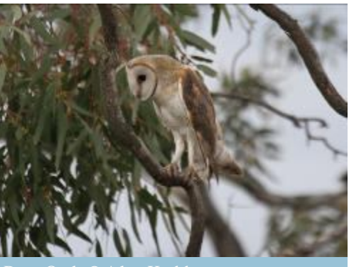
Barn Owl

Grey Wagtails were back on the river in February and the moorland birds, such as Snipe, Curlew and Lapwing, were all on the breeding grounds by early March. They had a tough start as a really heavy snow fall in late March, compounded by strong winds, caused some very deep snow drifts up there which lasted for several weeks. A Wigeon was at Leadmill Bridge in March and a Red Kite